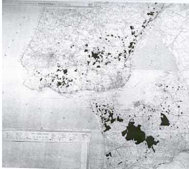
Figure 2: “Conjuntos Habitacionais Clandestinos na Região de Lisboa” (Eugen Bruno, 1984)

The location of the UAIG evidences relations with the space morphology and its proximity to the metropolis, there are already some studies that reveal the location of UAIG in the MLA (DGOTDU, 1996) (Rolo, 2005) (Raposo, 2009) (Gonçalves, Alves e Nunes da Silva, 2010).