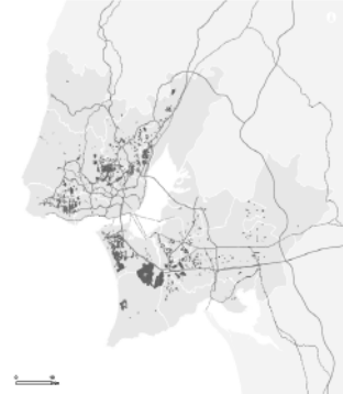
Figure 4: Mapping UAIG (Isabel Raposo, 2009)

Participation and the idea of collective are increasingly valuable in contemporary discourse and architectural practices (Arnstein, 1969) (Giancarlo de Carlo, 1970) (Habraken, 1972) (Hamdi, 1995, 1997, 2004, 2010) (Sanoff, 1990) (Spinizzi, 2005). Several experiences in the practice of urban requalification at the international level allow legitimizing the paradigm shift (BIG, Topotek1, Superflex, 2012) (Zuloark, 2010) (Ermacora, Bullivant, 2015). The publications on this intervention perspective have been multiplied, expressing the growing disciplinary interest in the field of architecture, especially in the requalification and transformation of informal settlements. There are several architects who value community participation in the strategy of intervening in public space, taking it as a point of spatial, social and cultural relations and identity and cohesion (Rosa, 2011, 2013, 2015) (Andreini, Casamonti, Giberti, 2012) (Jáuregui, 2010, 2012, 2013).